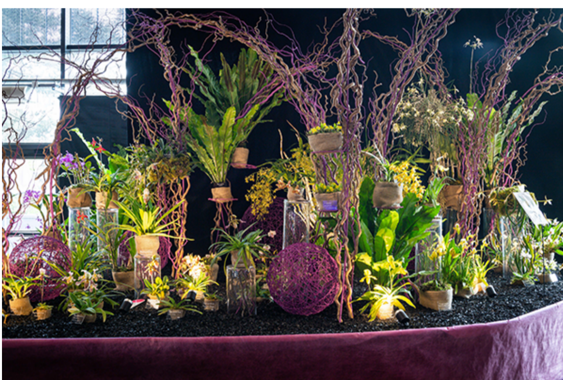
A creative display from a contest at the Florales Internationales 2019.

The organisers of the 13th edition of Florales Internationales 2024, the Comité des Florales – Nantes, are currently hosting a "Young Creators Contest."