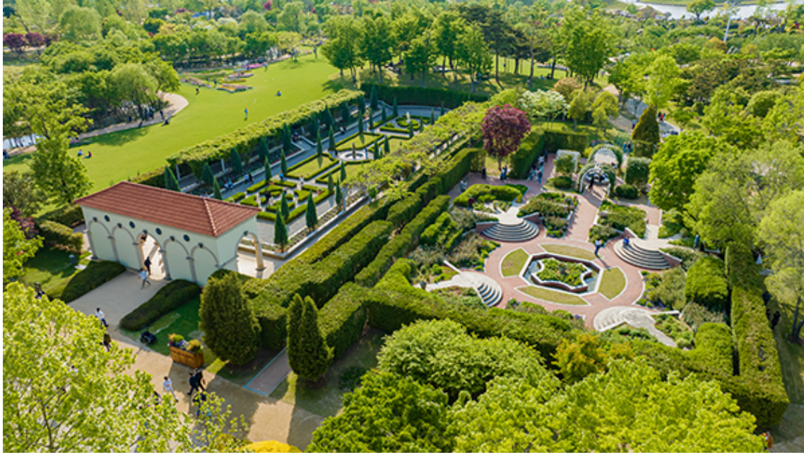
(Left to right) The Italian Garden and the King Charles III Garden.

The gardens and pavilions constructed and managed by international Expo participants are attracting many visitors to the International Horticultural Expo in Suncheon.