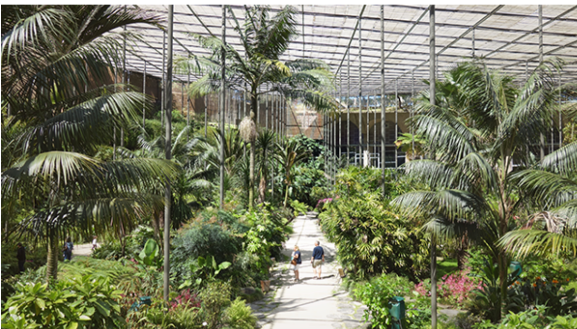
The Estufa Fria is a greenhouse with gardens, ponds, plants and trees located in Eduardo VII Park, Lisbon, Portugal.

The host cities for AIPH-approved Horticultural Expos will be providing progress reports on 13 March, at AIPH Spring Meeting 2023 in Lisbon, Portugal.