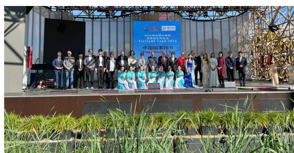
AIPH professionals and invited VIP delegates join the performers on stage for the National Chinese Day at the Floriade.

The visit also included performances and a welcome dedicated to China's National Day, celebrated on 29 September.