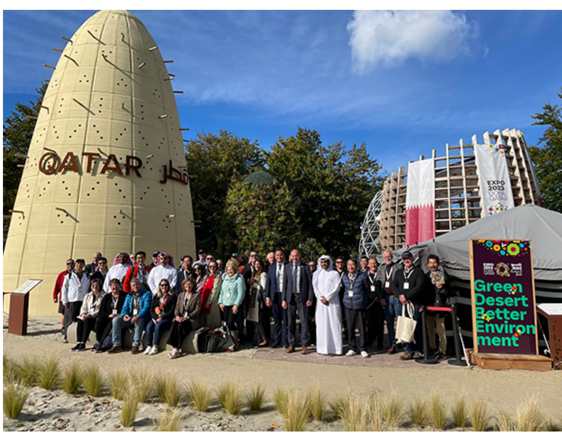
AIPH delegates at the Qatar pavilion, standing in front of the pigeon tower at the Floriade, during the VIP Tour day.