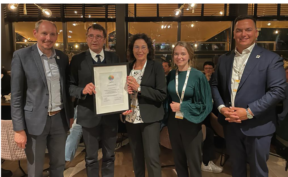
Florales Committee receives AIPH approval for Florales Internationales 2024.

AIPH has approved the application for Florales Internationales 2024 from the Florales Committee Nantes.