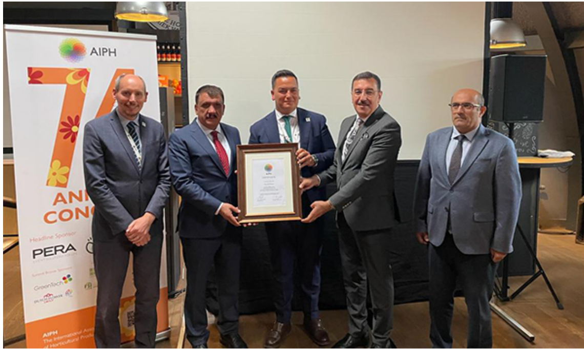
Malatya Metropolitan Municipality receive AIPH approval for Expo 2028 Malatya

AIPH members approved the application from Malatya Metropolitan Municipality for a Category B International Horticultural Exhibition in the city of Malatya, Türkiye, for 2028. Malatya is in the Eastern Anatolia region of Türkiye. It is a multicultural city and home to almost one million people. It also has a rich history of more than 7,000 years, serving as an important meeting point for many civilisations passing through it.