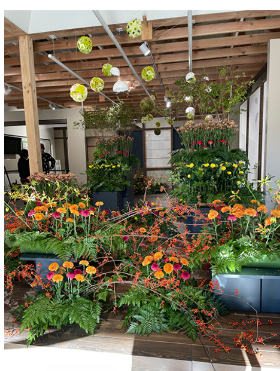
(Top) Outside the Satoyama Japanese garden at the Floriade; and (above) floral arrangement inside the pavilion.

How do Horticultural Expos Worldwide act as a source of inspiration for each other, governments, professionals and communities?