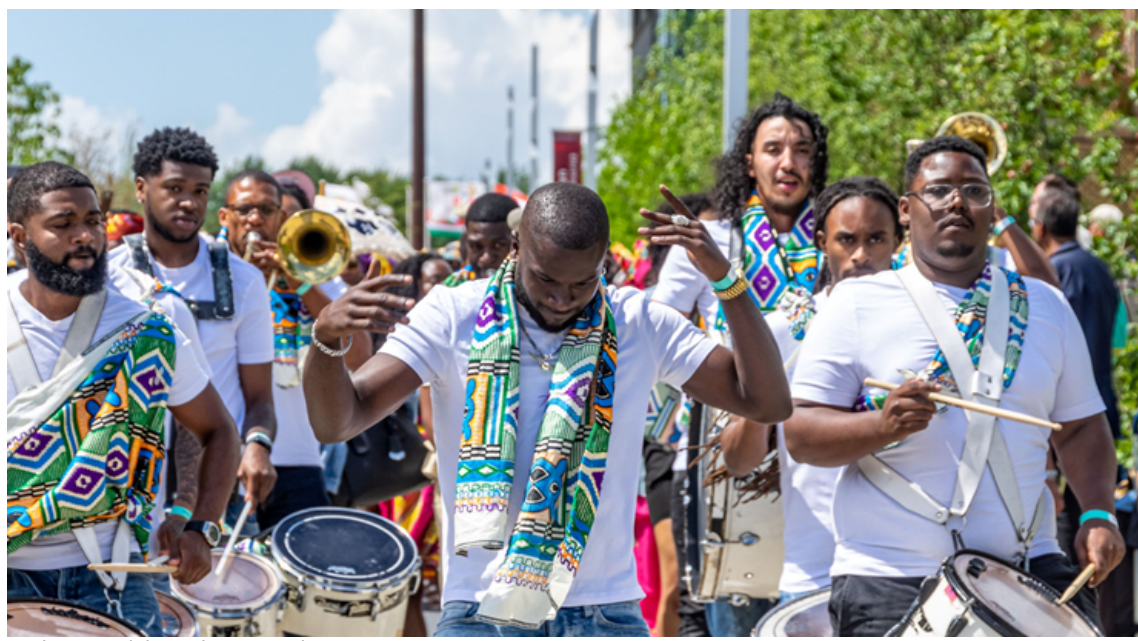
Suriname celebrated on 1-3 July.

Every country that is present at Expo 2022 Floriade with a pavilion organises a National Day this summer. On these days, the host countries provide a special cultural programme on the main stage and show the best of their home countries: music, dance or theatre. Visitors can also talk to ministerial delegates and entrepreneurs from the countries to discover business opportunities.