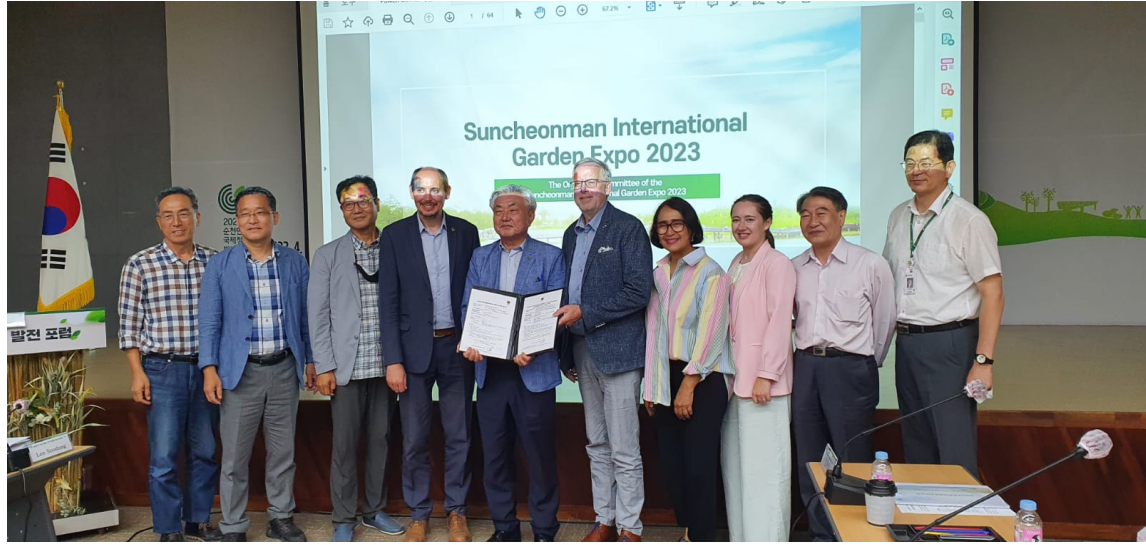
The AIPH team line up with the Expo Organising Committee of Suncheon Expo 2023

AIPH visited the Republic of Korea between 21 and 24 July, for an official site inspection in the city of Suncheon, who are busy preparing for an International Horticultural Expo in 2023.