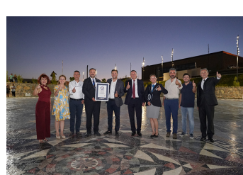
The Guinness World Records has officially certified the largest marble stone mosaic has been achieved by Hatay Metropolitan Municipality.

On Saturday, 2 July, Expo 2021 Hatay in Türkiye hosted its Award Ceremony to celebrate the achievements of the gardens and pavilions created by participating countries and municipalities.