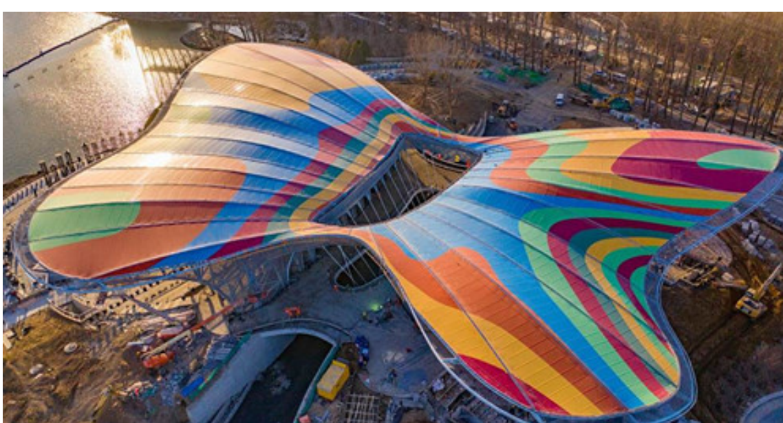
The stadium in Beijing Expo 2019.

AIPH is responsible for the world's finest horticultural expositions. Upholding the very highest standards, we ensure that approved exhibitions benefit growers and visitors alike by inspiring a greater appreciation of ornamental plants. Drawing on experience acquired over generations, we provide organisers with expert guidance to create world-class spectacles that live long in the memory. Visit our Past Expos page for final reports of events since 1960.