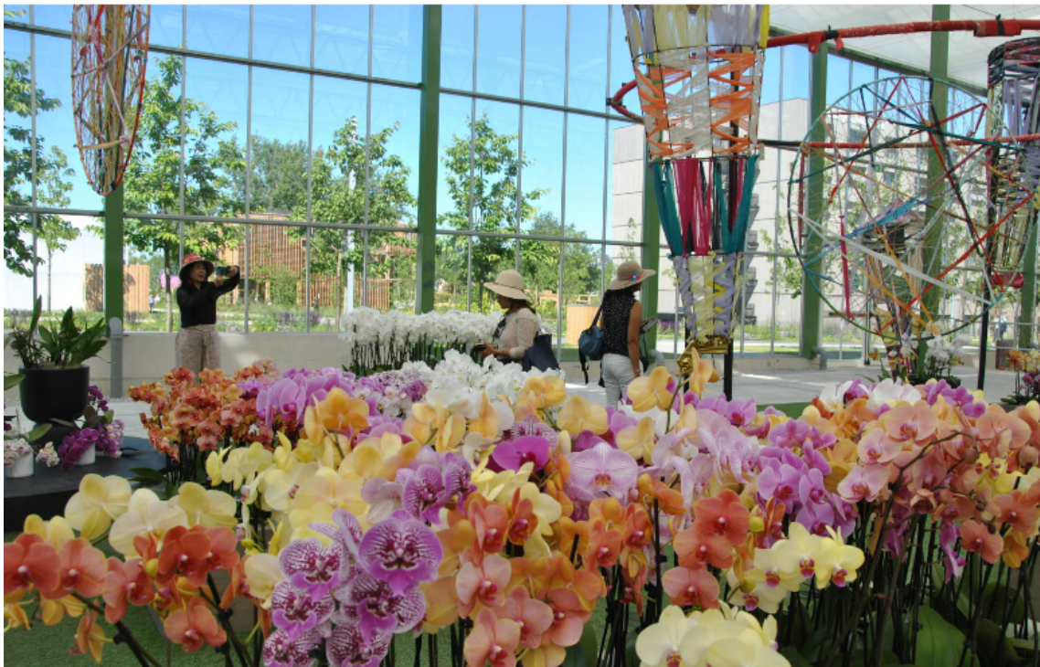
Inside the Glasshouse at Floriade Expo 2022 on 22 June.