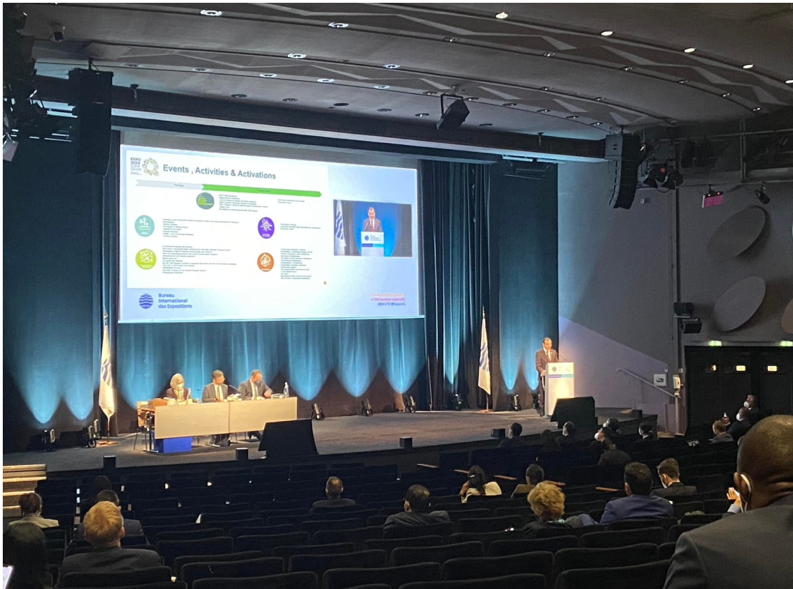
Expo 2023 Doha presentation at the BIE General Assembly

Learn more about Expo 2023 Doha Qatar, here.