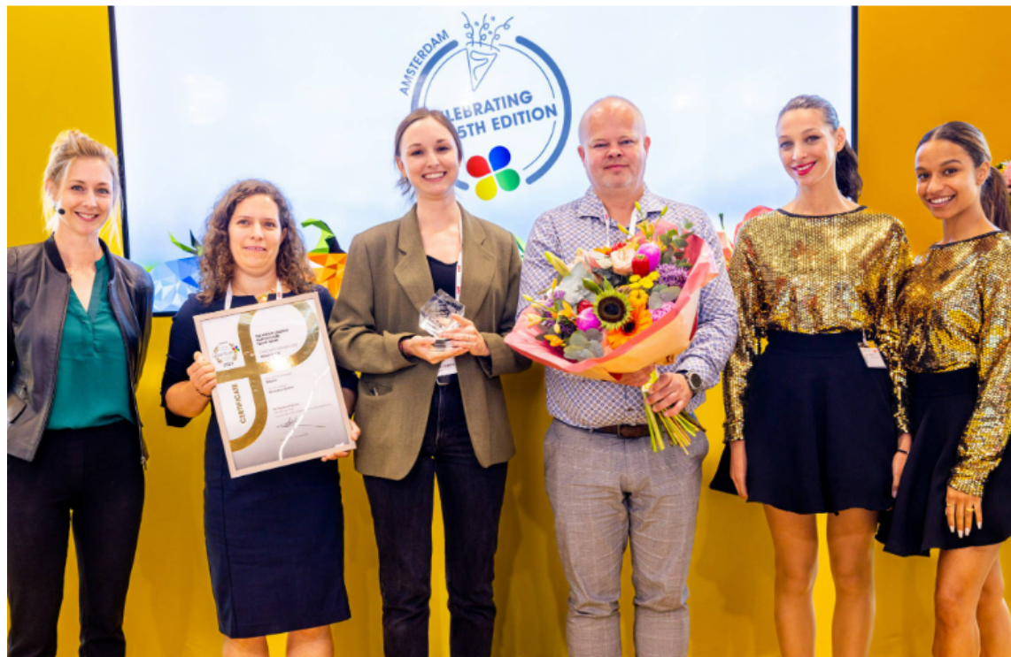
In the Innovation category biocontrols supplier Biobest from Belgium scooped up the coveted award for Micromus, a generalist predator for protected crops.

Overcrowded parking lots, busy aisles, full booths and an exciting array of greenhouse technology were the rule of the day for the opening of the 5th annual GreenTech at the RAI convention centre in Amsterdam, Netherlands.