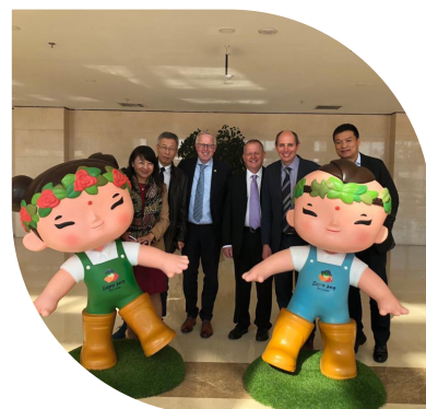
Mascots at Expo 2019 Beijing, People's Republic of China