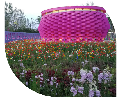
Expo 2019 Beijing, People's Republic of China.