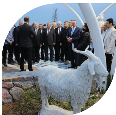
Governments executives visiting Expo 2021 Hatay before the Opening Ceremony, Republic of Türkiye