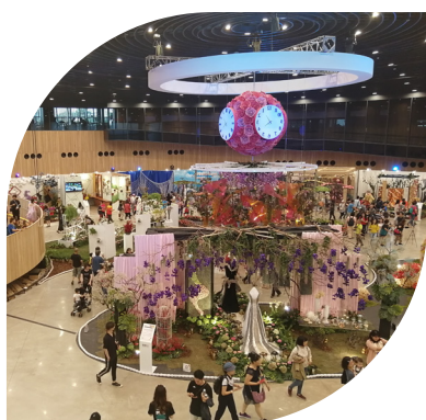
Expo 2018 Taichung Chinese Taipei