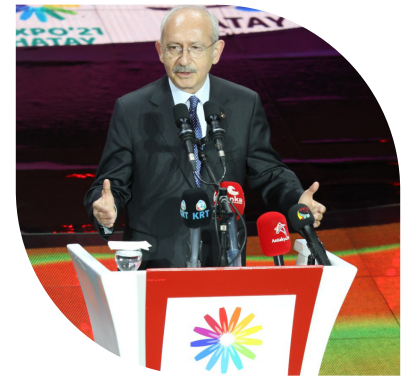
Kemal Kılıçdaroğlu, Chairman of the Republican People's Party, opens Expo 2021 Hatay