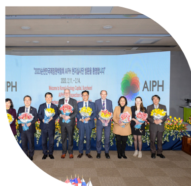
Site inspection of Expo 2023 Suncheonman International Garden, South Korea