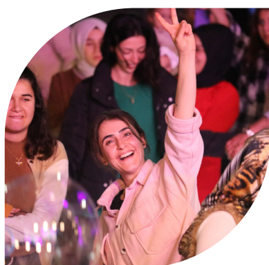
Happy visitors at Expo 2021 Hatay, Republic of Türkiye