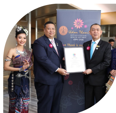
Approval of Udon Thani Expo 2026 at AIPH 2022 Spring Meeting in Dubai, UAE.