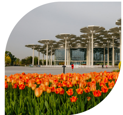
Expo 2019 Beijing, People's Republic of China.