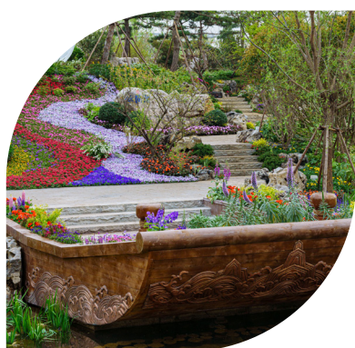
Expo 2021 Yangzhou, People's Republic of China.