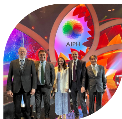
AIPH team on the stage of Expo 2021 Hatay, Republic of Türkiye