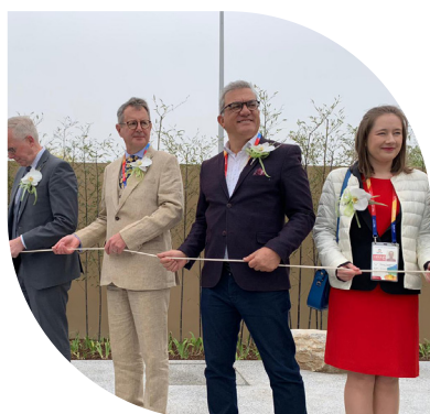
AIPH team cutting the ribbon at Expo 2019 Beijing, People's Republic of China.