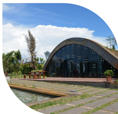
Expo 2016 Antalya Republic of Türkiye