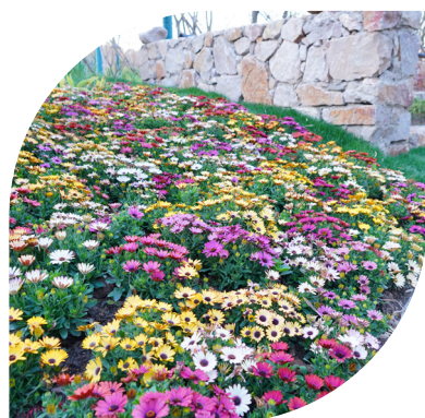
Expo 2021 Yangzhou, People's Republic of China.