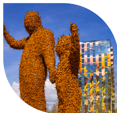
Expo 2022 Floriade Amsterdam Almere, the Netherlands.