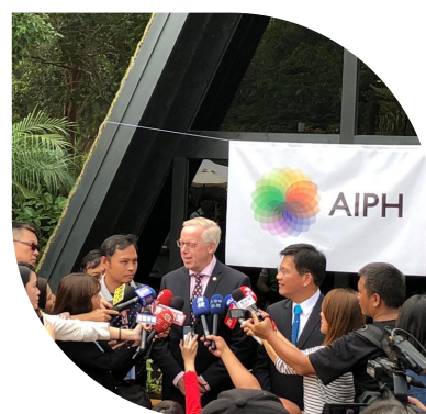
Press conference with Mayor of Taichung, Chinese Taipei at Expo 2018