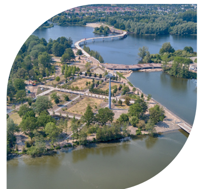
Expo 2022 Floriade Amsterdam Almere, the Netherlands.