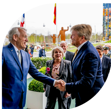
His Majesty King Willem-Alexander opens Expo 2022 Floriade Amsterdam Almere