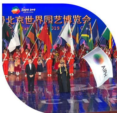
Opening ceremony of Expo 2019 Beijing, People's Republic of China.