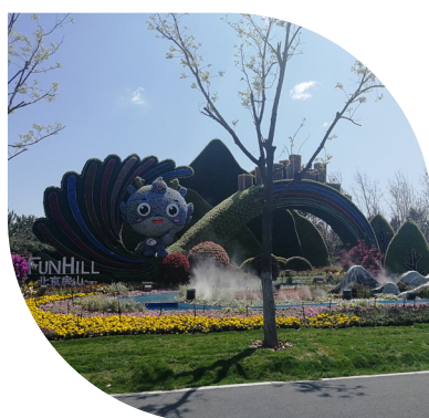
Expo 2019 Beijing, People's Republic of China.