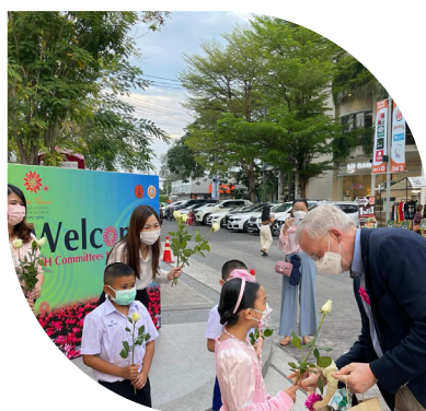
Welcoming Expo 2026 Udon Thani, Thailand