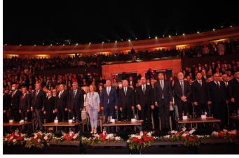
Distinguished guests, including Mr Uğur Poyraz, of the IYI Party, stand for the National Anthem at Expo 2021 Hatay (Türkiye).