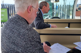
AIPH Jury team at Expo 2021 Hatay, were driven around the sites of Antakya and Iskenderun in a golf cart.