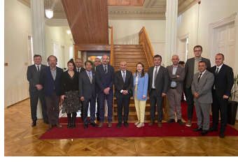
Expo 2026 Izmir, Republic of Türkiye.

Expo site inspections reported by AIPH are an important part of preparing for a World Horticultural Expo.