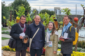
The AIPH Jury team joining the 103 experts to judge the gardens in the three historical parks of Nervi.

The landscape architecture, gardens, flowers, and plants are the primary motivation for visiting a Horticultural Expo for visitors. Many of the garden installations visitors see are from international and national participants invited to present their region or country's horticulture, and best represent the objectives and themes of the Expo.