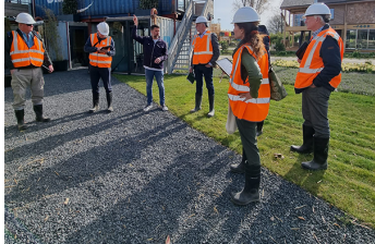
AIPH Jury team in hard hats at Expo 2022 Floriade with Nederlandse Tuinbouwraad (Dutch Horticultural Council).