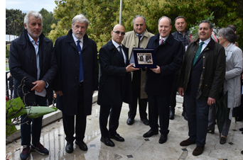
His Serene Highness Prince Albert of Monaco attends Euroflora 2022 (Italy), receiving an honour from organisers and people of Genoa.

This month has been very exciting and busy for AIPH in supporting the opening of Expo 2022 Floriade Amsterdam Almere (Netherlands) , Expo 2021 Hatay (Republic of Türkiye) and Euroflora 2022 (Italy) . In this April's newsletter we explain more about our role in World Horticultural Expos.