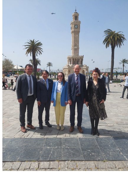
AIPH delegates in Izmir.

The team held successful meetings with the city administration and counsellors on key strategic aspects.