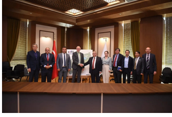
Expo 2023 Kahramanmaraş, Republic of Türkiye.