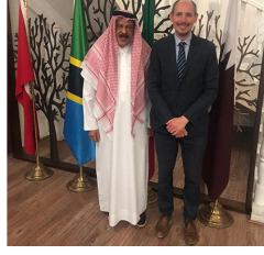
Expo 2023 Doha Qatar