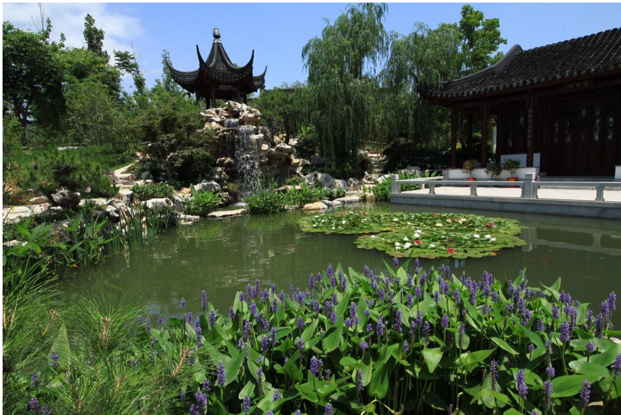
Garden of Jiangsu Province

For international horticultural exhibitions in China AIPH works closely with its member the China Flower Association.